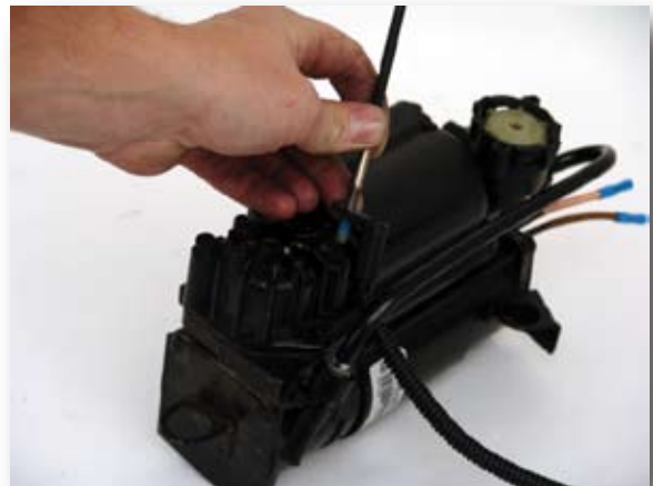
10. Place the thermal switch in place on the new compressor and retighten head bolt.