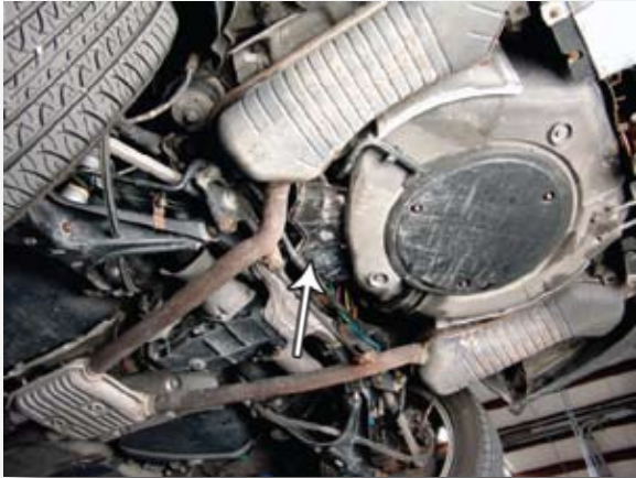
1. The compressor is located in front of the spare tire well underneath the car.