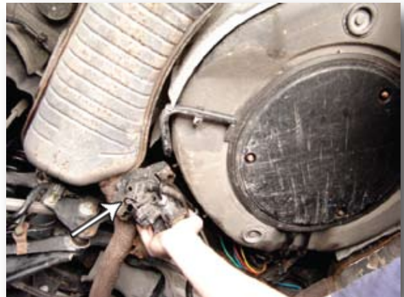
6. Remove the old compressor from the car.