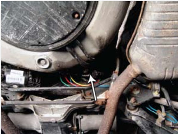
5. Disconnect the three electrical plugs, airline and intake air hose from the compressor. One plug is on the solenoid while the other two are positioned to the right.