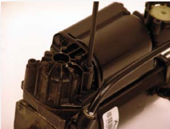
9. Loosen and remove the head bolt of the replacement compressor, as shown.