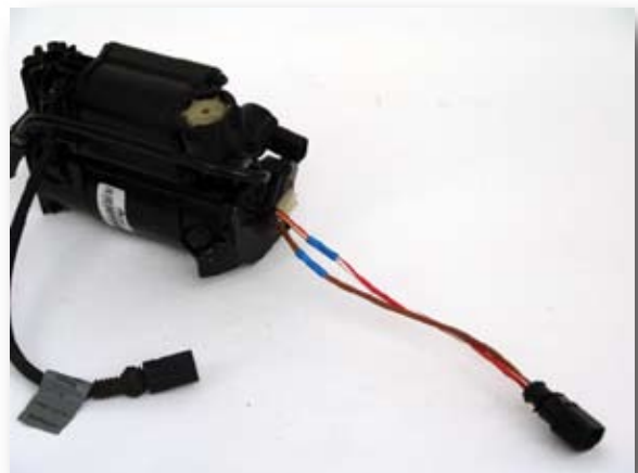
12. Completed unit ready for installation in the reverse of steps 6-1.