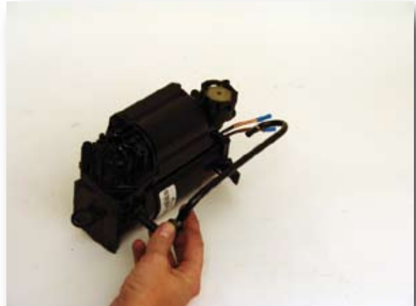
8. Attach the air intake tube to the new compressor assembly.