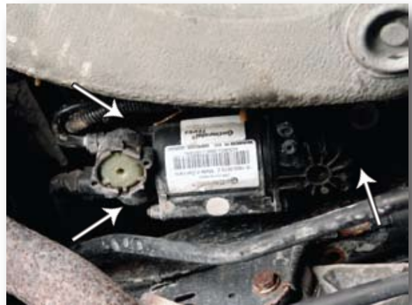
4. The compressor is held on with three nuts, one on each isolator. Isolators will be reused on the new assembly.