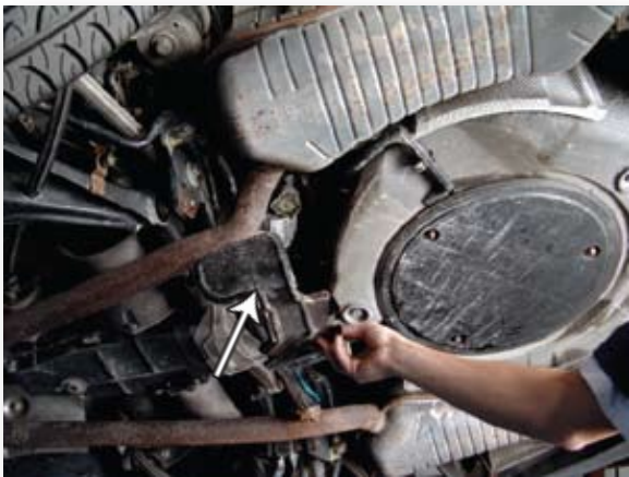
3. With the three nuts removed, remove the cover to expose the compressor.