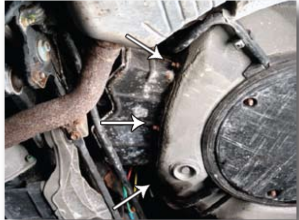
2. Remove the protective cover from the underside of the compressor via the three mounting studs.