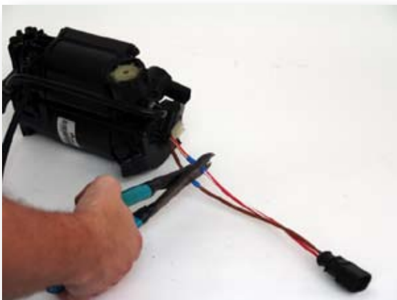
11. Strip the ends of the power cord wires and crimp them to the terminated ends.