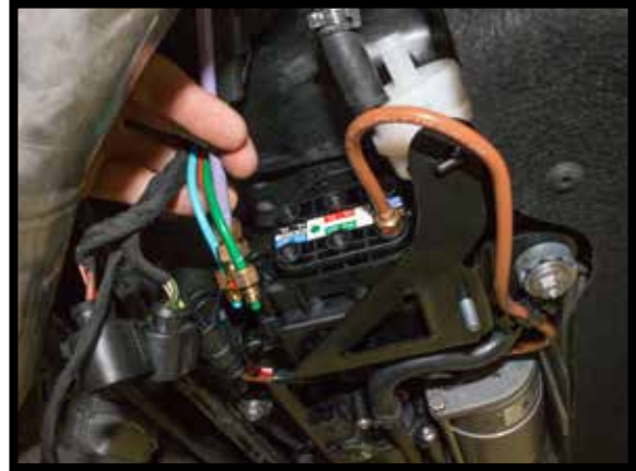
FIGURE G, H