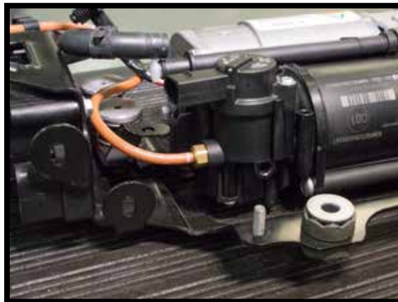
FIGURES Q, R, S