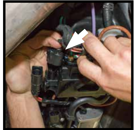
FIGURES C, D, E