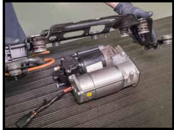
FIGURES M, N