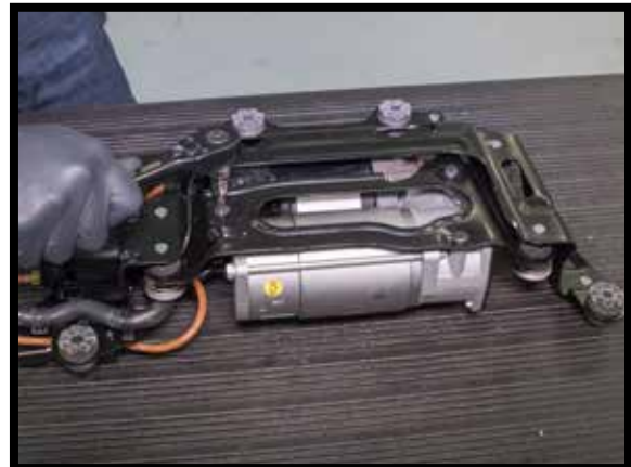
FIGURES O, P