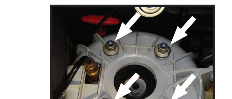
AIR LINE IS READY FOR INSTALLATION

SLIDE THE AIR FITTING OFF OF THE AIR LINE